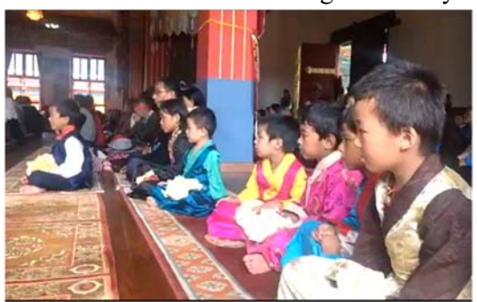
Lapchi children living happily together in their Lapchi Compassion Home