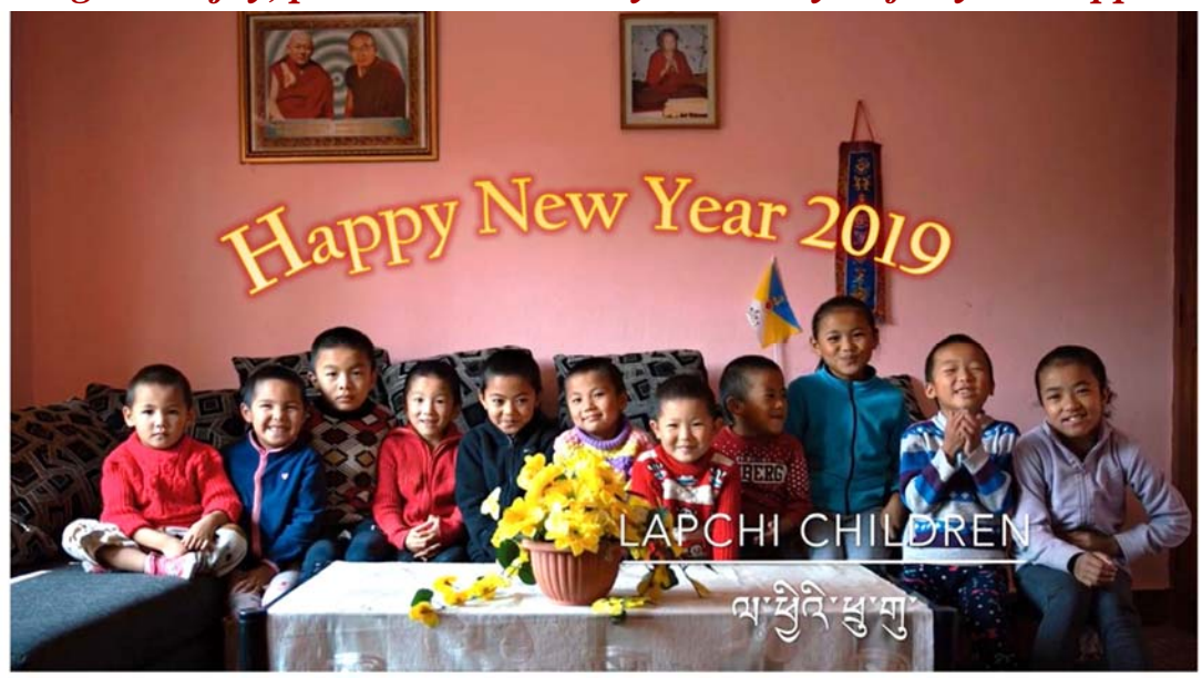
Watch them on http://www.youtube.com/watch?v=wZqT7mCvRYc

Wishing all our dear Dharma friends, a very Happy, Healthy, and Prosperous New year 2019! May every moment of the new year bring inner joy, peace and harmony! Thank you for your support!